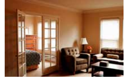
One bedroom living area