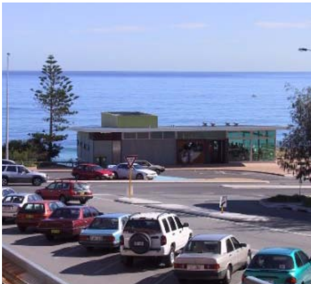
View from the hostel

In addition to the excellent kitchen and laundry facilities, the hostel has brilliant leisure facilities that include free use of surf and boogie boards, a games room and pool table. There is a choice of either single or multi-share rooms and each room has en-suite facilities, a fridge, linen and a locker.