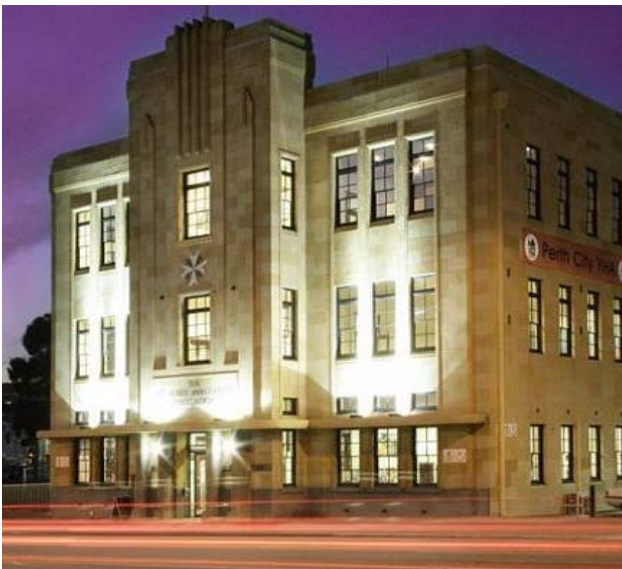
Perth City YHA

Whatever you plan to do on your travels, you can do it in Perth, the city of lights. A visit to Kings Park is essential - take a leisurely stroll through natural Australian bush while enjoying spectacular views of the city. Take a day trip to Rottnest Island or simply enjoy the shopping in one of the many malls.