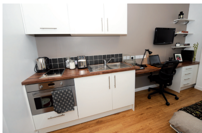
Fully equipped kitchenette