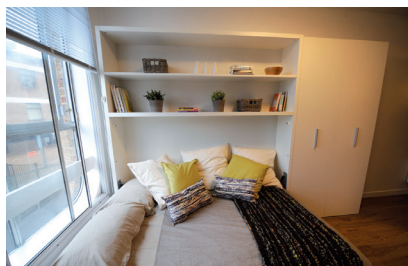
Studio apartment with folding bed