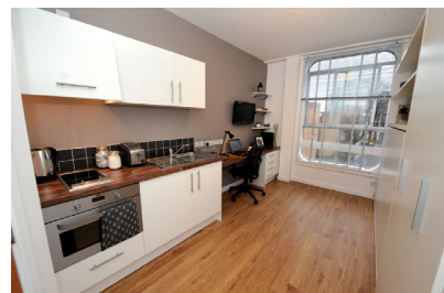
Kitchenette and study desk