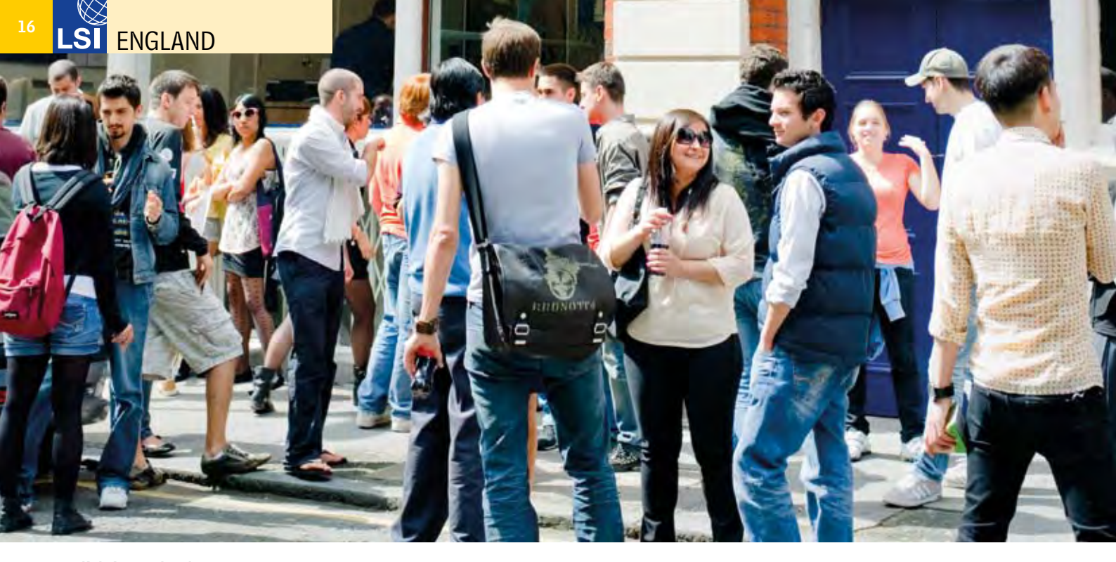
English in England