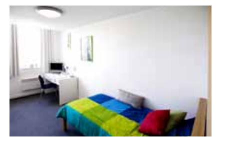
Single bedroom at Sebastian Street