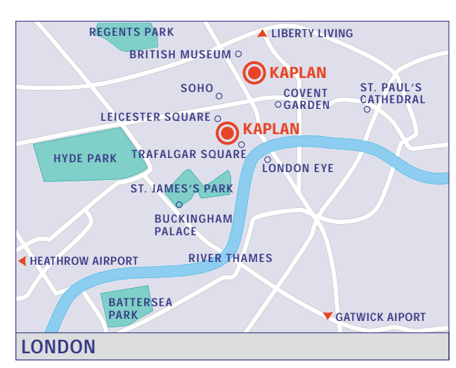
Liberty Living 1 Sebastian Street 153-157 Goswell Road London EC1V 7ET