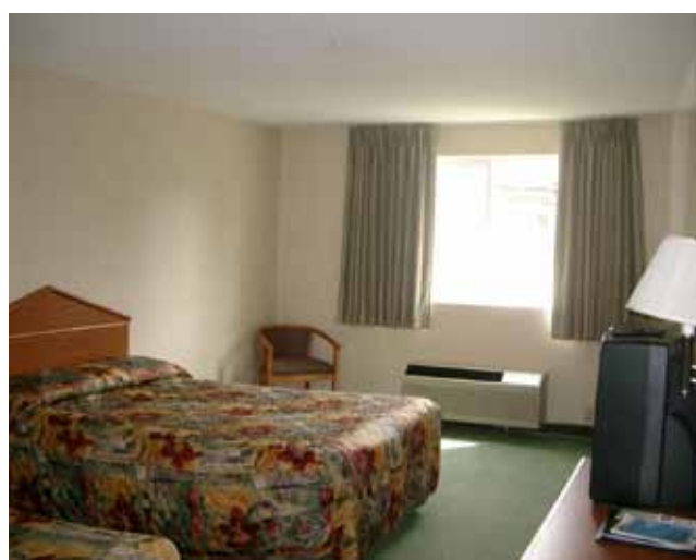
Garden Suites 22845 Pacific Hwy Des Moines, WA 98198