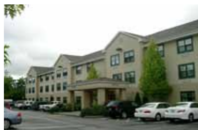
Exterior of the apartments