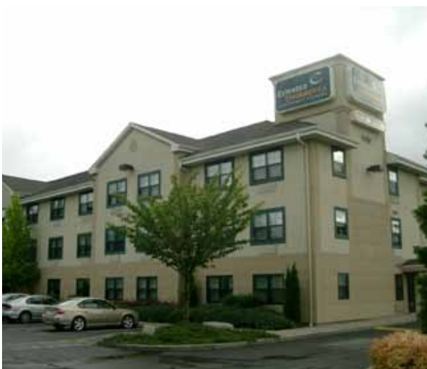
Extended Stay Studio Apartments

*Kaplan does not arrange roommates for this option.