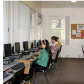
Kaplan Multimedia Center

Whittier is a lively campus with many student clubs and activities which Kaplan International Center students are welcome to join. We plan a busy schedule of optional excursions and activities year-round including trips to Disneyland, Magic Mountain & Universal Studios. There are also tours of Los Angeles including Rodeo Drive and trips to Malibu, Venice Beach and Sea World in San Diego. Many on-campus activities are also offered.