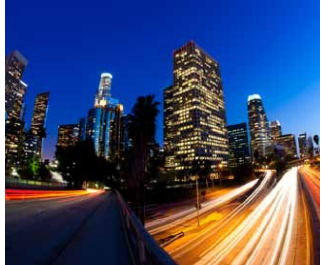
Los Angeles at night

Taxi – approximately $85 (+ 15% gratuity)