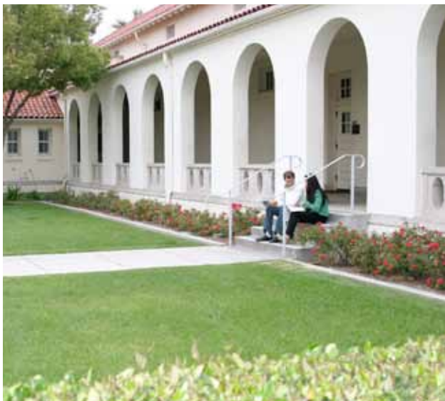
Whittier College campus

Founded in 1901, Whittier College has been recognized as one of the best small colleges in the USA. Whittier College is a selective, independent, four-year college that offers a nationally recognized liberal arts curriculum, a vibrant campus community and a strong academic tradition. Kaplan International Center Whittier was founded in 1989.