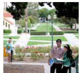
Whittier college campus