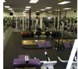
Whittier College fitness center