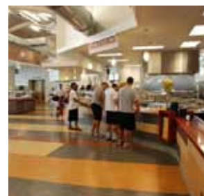
Whittier College cafeteria