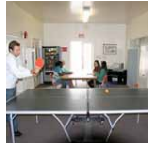
Kaplan student lounge