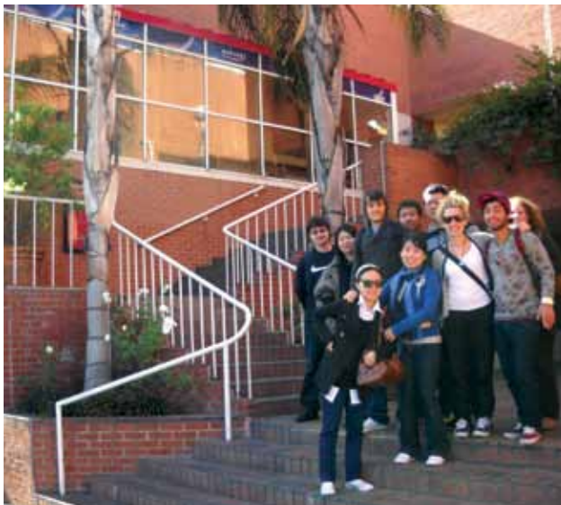
Kaplan International Center Westwood

We encourage you to take full advantage of our excellent educational quality programs and the overall experience of studying and living in the United States. Many of the Westwood students use our University Placement Services and transfer to Santa Monica College, which has a high transfer rate to schools like UCLA and the University of Southern California (USC).