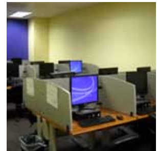
New computer lab