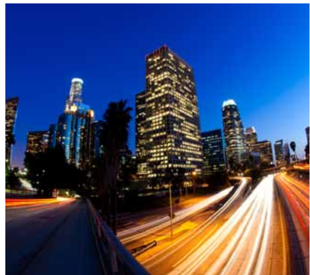
Los Angeles at night