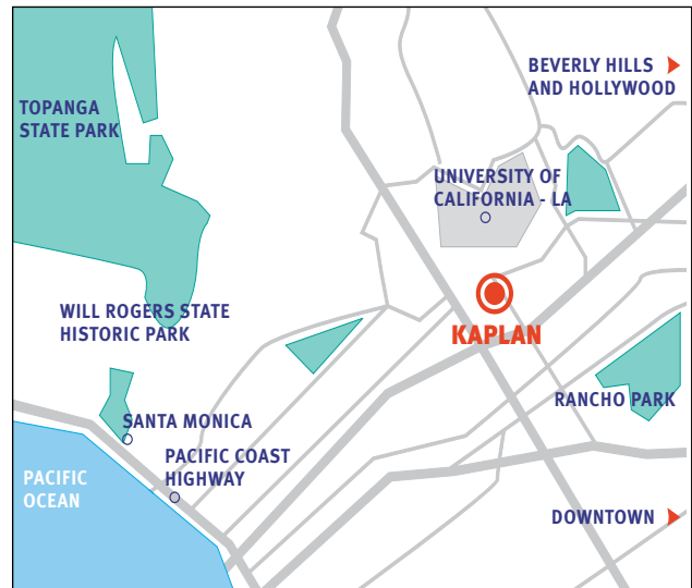
Kaplan International Center - Westwood 1133 Westwood Blvd. Suite 201 Los Angeles, CA 90024 USA

Kaplan International Centers in the USA are accredited by the Accrediting Council for Continuing Education and Training.