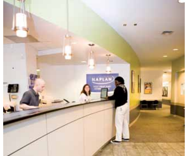
Kaplan International Center Washington D.C. reception

Reagan National Airport is conveniently connected to Washington, DC by Metro.