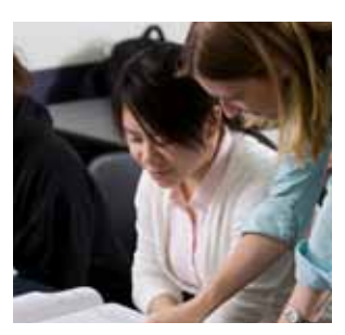
Kaplan teacher with students