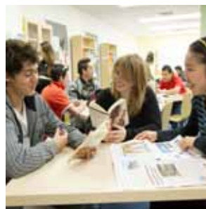
Study Centre / library