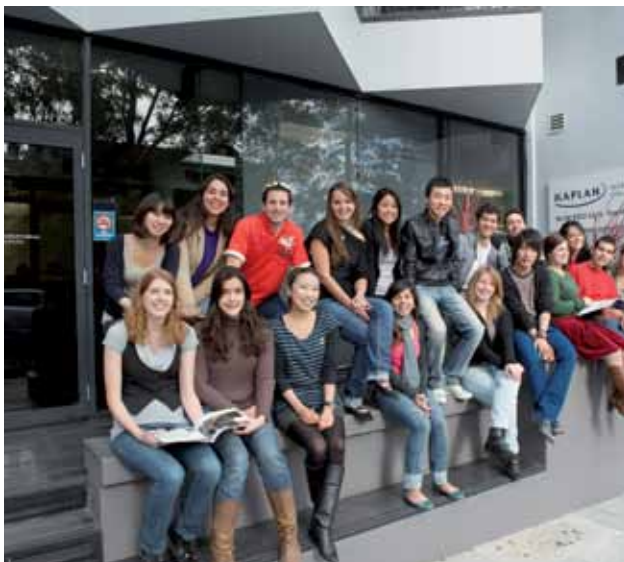
Kaplan International College Perth

Located on the Sunset coast, Perth is loved for its blue skies and white beaches. The city caters to a variety of tastes with its exquisite seafood, bustling street markets and excellent range of shops selling everything from traditional souvenirs through to designer clothes and precious gemstones. You can also expect a very warm welcome from Perth locals who are renowned for their friendliness and hospitality.