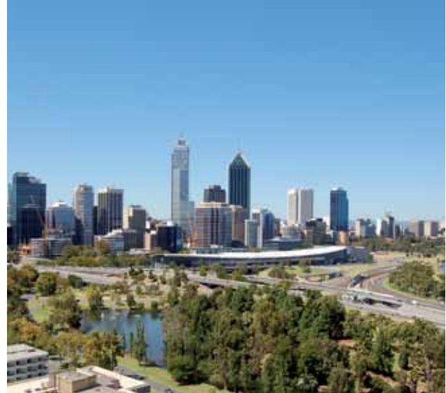
Perth city view from King's Park