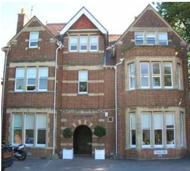
Kaplan International College Oxford

Kaplan International College Oxford is housed in an attractive Edwardian building with 3 floors and a modern, prize winning extension. The college is situated just 10 minutes north of Oxford's city centre and has a beautiful garden and courtyard at the back of the building: the perfect area for summer barbeques and sporting activities.