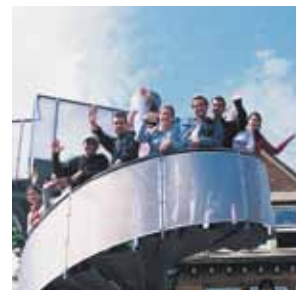
Outside of the college cafe