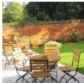
The college garden area

There are places of worship for all religions and faiths close to the college. A list of these and their locations is posted at the college.