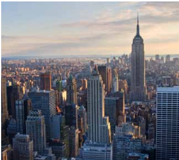
New York skyline

Our Empire State Building center towers above the city on the 63rd floor of this landmark building. Built in the 1930s, the Empire State Building is a part of both New York and US history and today still attracts visitors from around the world. The Empire State Building is just steps away from Macy's at Herald Square and the world's most famous arena, Madison Square Garden. There is access to major subway lines taking you to your accommodation, and every place in the city you'll want to visit.