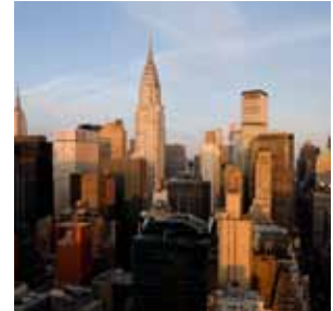
New York skyline