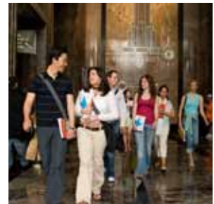
Empire State Building - reception