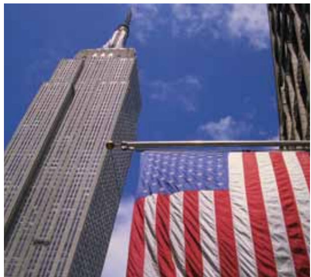
Kaplan International Center New York - Empire State Building