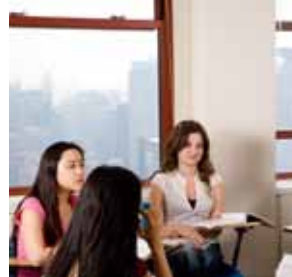
Bright and spacious classrooms with amazing views of the city

Telephones are located outside The Empire State Building. There is an Internet Café across the street from the center. The Internet is also available at center for free and the center has wireless Internet access.