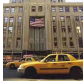
The Empire State Building entrance

While it doesn't take much imagination to keep yourself busy in New York during the time you're not studying, Kaplan provides a varied calendar of activities to fill your days. With workshops, parties, walking tours, museum trips, sporting events, Broadway shows and more, you'll discover parts of New York you didn't even know existed! These activities are lead by a member of the Kaplan staff and will help you to meet new people and discover the city.