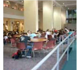
Students at Northeastern