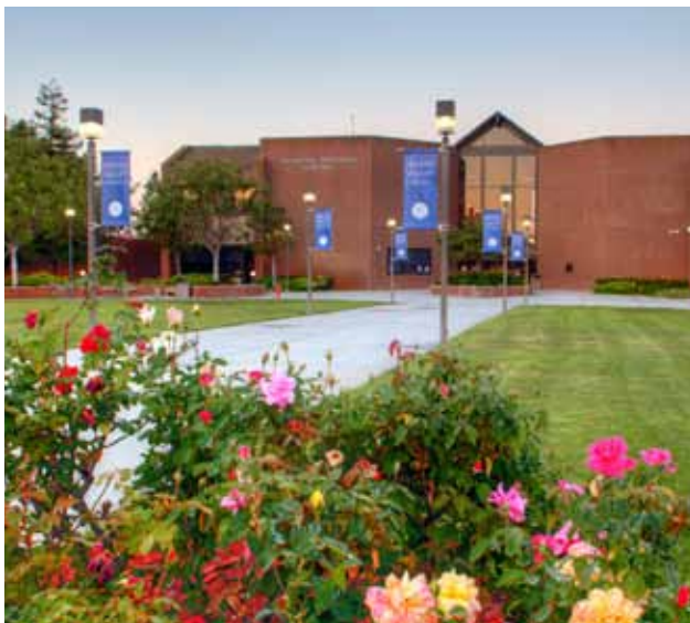
Irvine Valley College

Irvine Valley College is a 100-acre, two-year community college offering a variety of degree and certificate programs from traditional liberal arts and sciences to the most advanced technologies. At Irvine Valley College, students can fulfil their general education requirements for California State University systems. While at Kaplan International Center IVC, students can take classes at Irvine Valley College, as long as they place into the Upper-Intermediate level or higher.