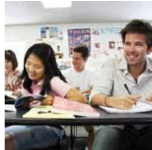
Irvine Valley College classroom

Kaplan International Center IVC offers students a wide selection of outdoor activities to choose from. Dancing, Tae Kwon Do, bowling and basketball are some of the more popular organized activities. Students also enjoy beach bonfires, movies, shopping and trying out new restaurants.