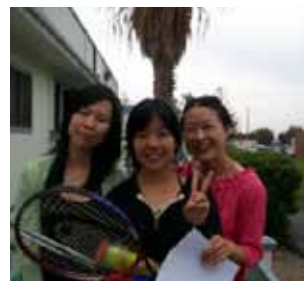
Life on campus