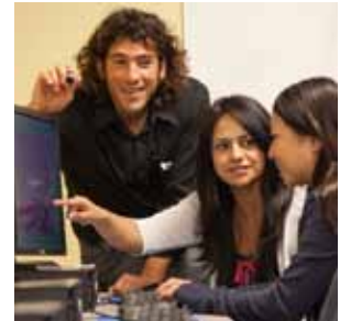
Multimedia room at IVC