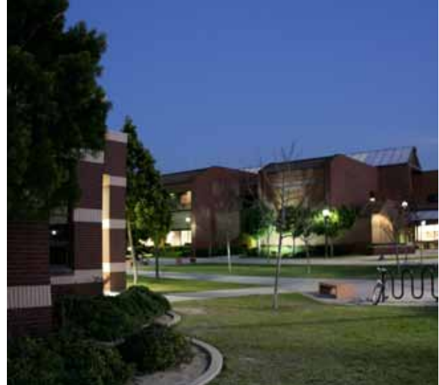
Irvine Valley College campus at night

Taxis are available outside the airport terminal.