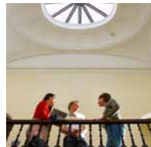
The interior of the college is spacious and bright