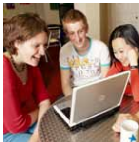
The student common room