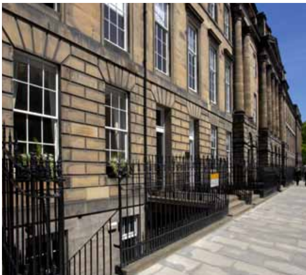
Kaplan International College Edinburgh

The college is in the very heart of Edinburgh, just minutes from the stylish shops of Princes Street and the imposing fortress of Edinburgh Castle. The college is housed in an elegant Georgian building and offers excellent facilities including free wireless Internet connection and a multimedia room with the latest language-learning technology.