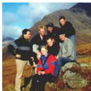
Activities programme includes optional hikes in the magnificent Scottish Highlands