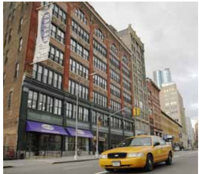
Kaplan International Center NY East Village