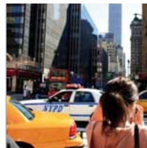
Empire State Building