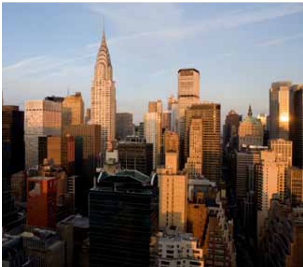
New York skyline

Our East Village Center is a wonderful, 2-story facility located in the heart of Manhattan's hip East Village. Just a block or two north of the Bowery, the former home of NYC's famed CBGB's rock club, we are minutes away from many of New York's most interesting sites: The Public Theater, located in the former Astor Library; the Cooper Union Great Hall, the site of many historic speeches and addresses; SOHO, the world-famous shopping district; and St. Mark's Place, the place to go for food, music, and a pair of cool shades! What's more, we're less than 5 minutes from Stern Business School and the New York University (NYU) main campus, in addition to major subway lines that can take you to your accommodation, and every place in the city you'll want to visit.