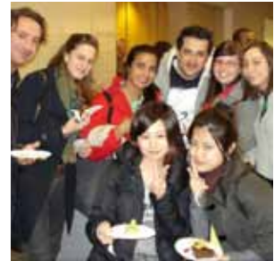
East Village student party