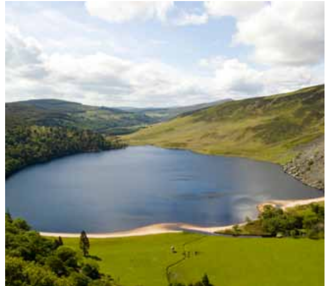
Beautiful Irish countryside