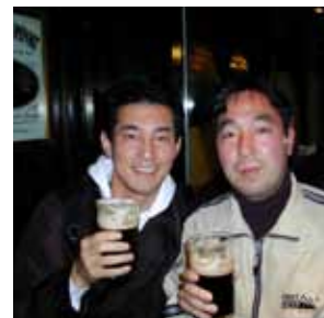
Students enjoying an Irish beer at one of the pubs in Temple Bar