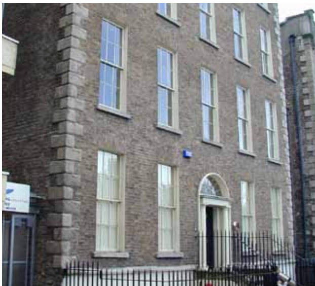
Kaplan International College Dublin

The college is housed in a magnificent Georgian building overlooking the River Liffey. Excellent facilities include a large student common room with new flat-screen computers for personal use, a self-study room, a dedicated study room and free wireless Internet access.