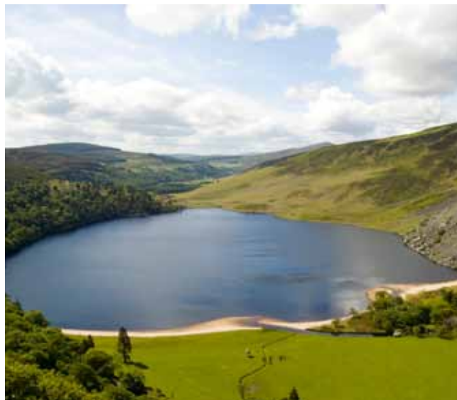
Beautiful Irish countryside