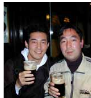
Students enjoying an Irish beer at one of the pubs in Temple Bar