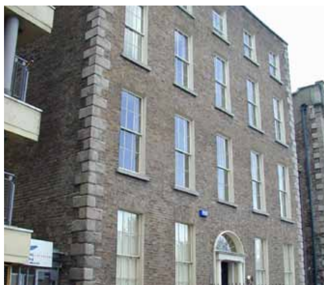
Kaplan International College Dublin

The college is housed in a magnificent Georgian building overlooking the River Liffey. Excellent facilities include a large student common room with new flat-screen computers for personal use, a self-study room, a dedicated study room and free wireless Internet access.