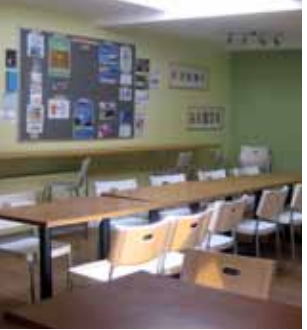
Kaplan International College coffee shop