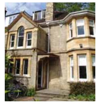
Classroom College exterior