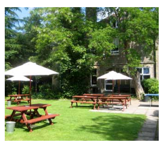
Picnic benches in the college garden

Trains to Cambridge depart from London Kings Cross station and London Liverpool Street every 30 minutes from 06.00 - 23.00. Journey time: 50 minutes. Tickets from Kings Cross cost £19.10 return (off peak) and tickets from Liverpool Street cost £9.60 return (off peak).