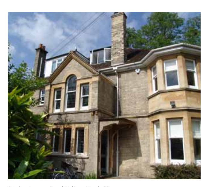
Kaplan International College Cambridge

Founded in the late 1970s, the college is housed in a large, converted Edwardian house with a modern extension. The college is west of the city centre in the quiet, residential area of Newnham, a 10-minute bus ride away from the centre. The college has its own gardens where we hold barbecues on warm summer evenings.