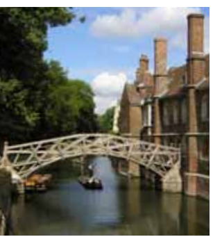
The Mathematical Bridge over the River Cam