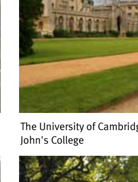
The University of Cambridge - St.