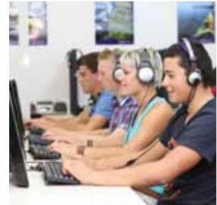
Study centre / library