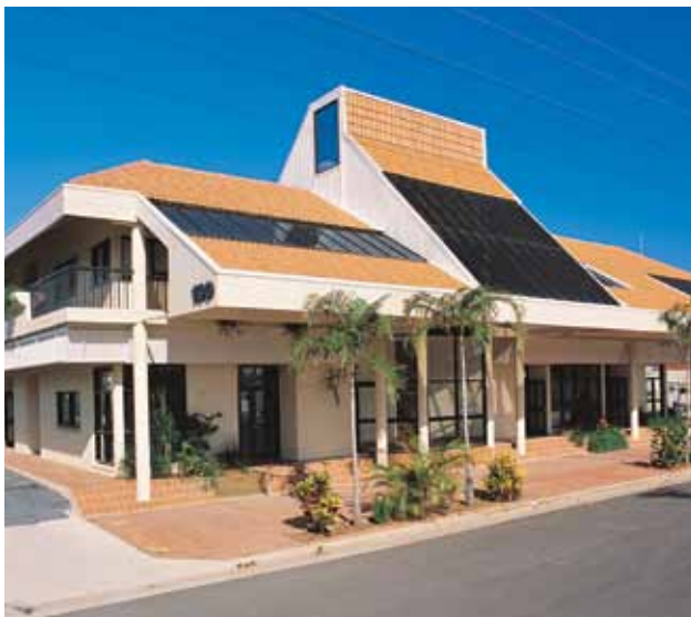
Kaplan International College Cairns

Cairns is a major tourist destination and all international visitors immediately feel welcome and at home in the city.