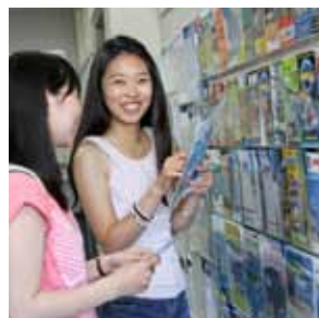
Tour and activities brochures

There are places of worship of most religions and faiths in Cairns. You can get more information about religious institutions from the reception.