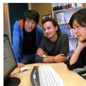
Study centre / library