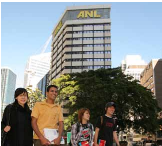
Kaplan International College Brisbane students (college in background)

Kaplan International College Brisbane is in a modern building and covers floors 1, 2 and 3. The convenient City Cat ferry river transport is only a few minutes' walk away. The college is located in the heart of the city with convenient public transport links and there are an abundance of shops, cafés, cinemas and restaurants close by. Bright, air-conditioned classrooms, free wireless internet access, a student lounge and a library provide an excellent learning environment for English language study and academic preparation.