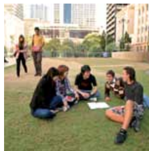
Students in the park