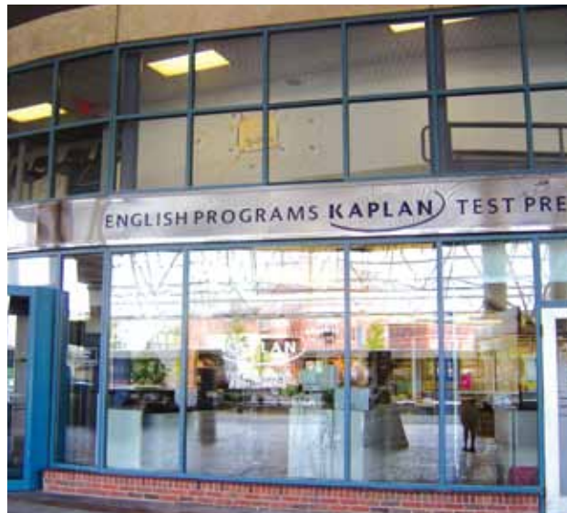
Kaplan International Center Boston

Please note that Kaplan International Centers staff are not at the center on weekends. If you need assistance, please call one of the emergency contact numbers.