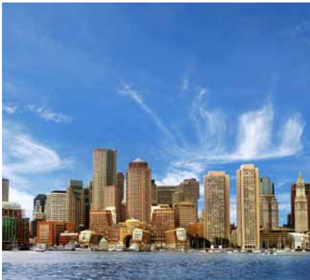
Kaplan International Center Boston

We look forward to welcoming you to the Kaplan International Center Boston and are certain that you will enjoy your time with us. We offer outstanding university preparation classes led by experienced instructors who have helped students excel for many years. We also offer an exciting activities program, and of course the city of Boston with all its great attractions is at your fingertips. Join the many students who make Boston their home studying at world-famous universities near our center such as Harvard University, MIT, Boston University, Suffolk University and many others.