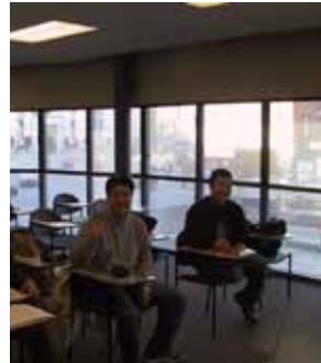
Students in the classroom

Students at the Kaplan Boston Center rave about our activities program, which includes something for all tastes. Among the most popular activities are an evening boat cruise, whale watching trips, soccer games, movie nights, and dinner at local restaurants. Other activities include trips