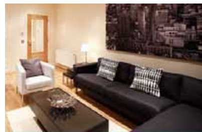
Communal living room