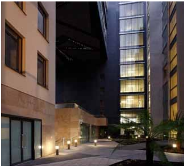
Heuston South Quarter

Heuston South Quarter is 25 minutes walking distance to the college and is within easy reach of the city centre by foot, bicycle, bus and Luas.