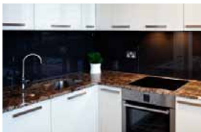
Fully-equipped shared kitchen