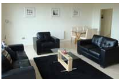
Communal living area