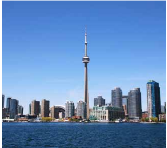
View of Toronto City

The hostel has 25 home-style washrooms for single person use, to provide guest with more privacy than the traditional group washrooms found in many hostels. Be sure to book well in advance for summer stays, the Canadiana becomes full in advance during peak-travel months.