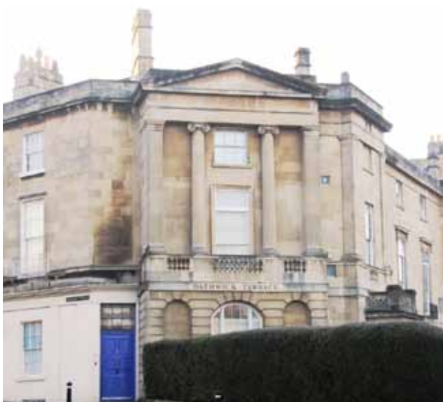
5 George's Place

A £200 deposit is payable by credit card on arrival at the school.